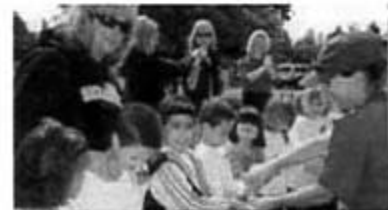
Students Demonstrate Good Hand-Washing Technique

Portions of this Clover Safe incorporate information modified from Compendium of Measures to Prevent Disease Associated with Animals in Public Places, 2006, National Association of State Public Health Veterinarians, 18 pages. Available online at http://www.nasphv.org/Documents/AnimalsInPublicSettings.pdf .